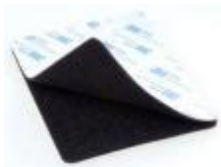
3M Velcro (default)